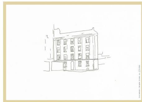
Fig. 12. House of Building Association