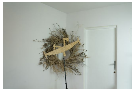
Fig. 1. Wiecha ("Topping Out"). "From the soil here beneath this house"