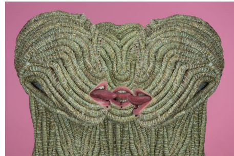
Il. 25. Wahlverwandtschaft Il. 28, 34, 35. Useful Ties

between the Enthusiasts are visualized by Piskorska in the form of schematic drawings depicting women wrestlers, or lovers, in an intimate embrace. The boundaries between bodies become blurred. It is easy to lose track in the tangle of arms and legs of which body part belongs to whom. This conveys the way in which the group members actually interacted with each other: a letter addressed to any one of them was in fact meant for the eyes of everyone else. Different individuals merged into a single figure, for example when Żmichowska wrote: "My dearest Tekla-Bianka"