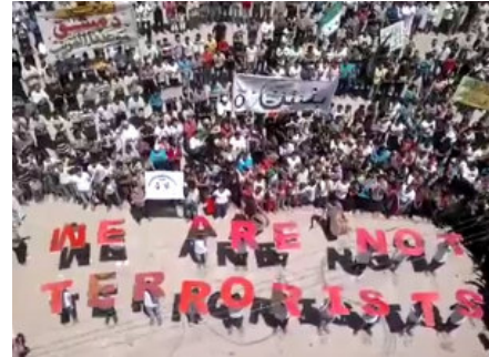
People forming a sign saying „We are not terrorists“. Film available on YouTube.com

In that situation, the protest performance was entirely oriented to the needs of the video recording. A human fresco requires devising a complex choreography based on precise coordination between the camera operator and the protesters. It intertwines two very different cultures: festive popular culture borrowed from the football stadium, and the ceremonial political culture that characterizes processions in honor of a leader – much appreciated by Hafez al-Assad in the 1980s and 1990s.