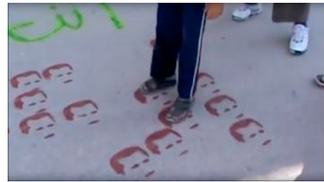
First free elections in Hama. Film available on Youtube.com

At the beginning of the recording 24 the camera operator shows the date and adds: "The parliament does not represent us. This is how we vote in Hama, in a free and fully democratic way." We then see dozens of people walking over stenciled graffiti images of Bashar al-Assad's face that form the command: "Trample on it." Finally, some of them spit on a poster of the president.