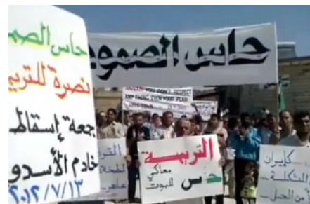
Banners presented at the "Down with Annan" manifestation in the Idlib region 17

One of the video recordings, 17 shot in the Idlib region of northern Syria, shows particularly clearly some of the elements of the professionalization of video documentation of the protests. It manifests a rupture between the visual record