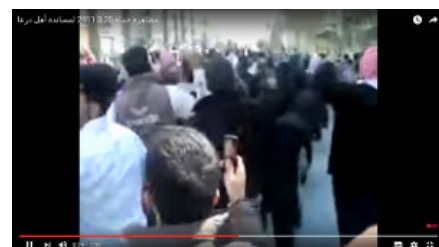
Manifestation in Hama on 25 March 2011 to support the inhabitants of Dara 12

The film shot in Hama just 10 days after the first demonstration in Dara shows particularly well what filming practices looked like in the first phase of the protests. What initially occurs is a deconcentration with regard to sound: the person shooting the video shouts alongside other protesters: "Freedom," "Peaceful," 13 "There is no god but God," 14 and "With our souls, with our blood, we will sacrifice ourselves for you, Dara." The