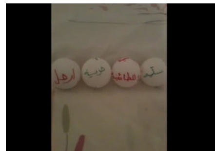
Balls of freedom in the al-Muhajireen district. Film available on Youtube.com

Creativity unleashed by video recordings also led to the privatization of protest space due to the emergence of forms of action based on a limited number of participants. The framework of activity and visibility thus defined prompts the issue of anonymity. After all, in a crowd, even if individuals protest with uncovered faces, their identity becomes dissolved in collectivity. In turn, in filmed actions, exposure strengthens individualization,